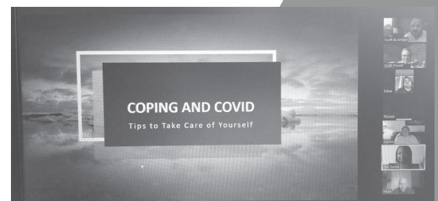
AHIF provided a session on tips for coping with COVID-19