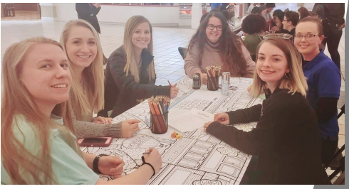
Coloring for a Cause Event in Auburn