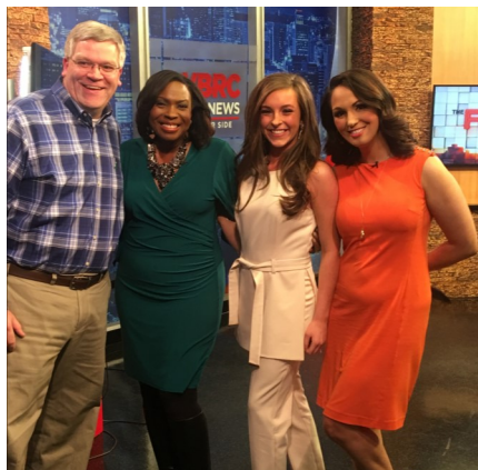
Fox 6 News Birmingham

In Mobile, we held our first ever “memory walk” where TBI survivors and their families walked to honor those living with TBI and in memory of those we have lost to TBI.