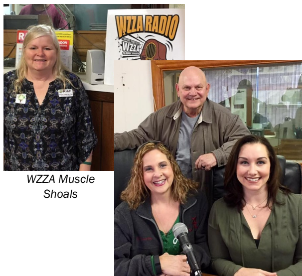
WZZA Muscle Shoals