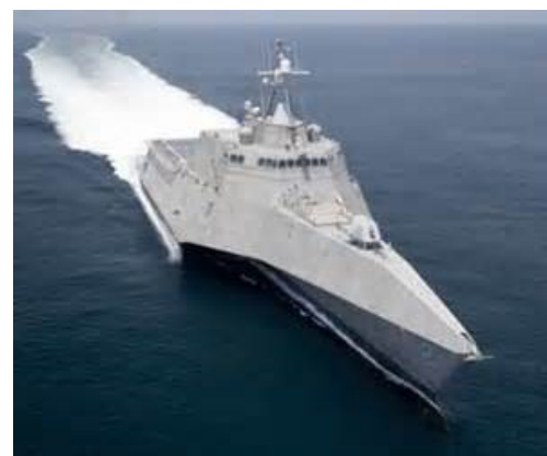
USS Gabrielle Giffords